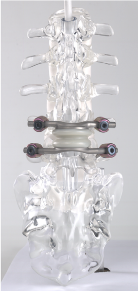
FIG. 1. The TOPS System for total posterior arthroplasty prosthesis (Premia Spine Ltd.).

laminectomy, and bilateral total facetectomy to a radical degree compared with surgical fusion. The device resists translation and shear force and recreates physiological motion. The biomechanical and kinematic behaviors of the device in cadaveric spines have been closely examined. 10,17