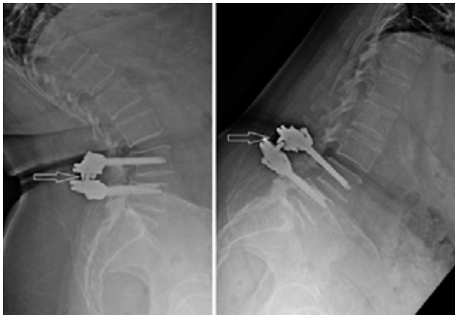
FIG. 3. Flexion and extension lateral radiographs obtained after 11 years of follow-up. We can see that there is motion at the L4–5 segment as the articulating core of the TOPS device moves on flexion and extension images (arrows).

disc degeneration according to the Pfirrmann classification 11 at the second, third, or fourth level above the index level, was observed in 4 patients in the 11-year follow-up period compared to 3 patients in the 7-year follow-up period. Retrolisthesis at the second, third, or fourth level above the index level was observed in 5 patients in the 11-year follow-up period. Data regarding the index and adjacent-level disc height as to the overall lumbar lordosis are presented in Table 3.